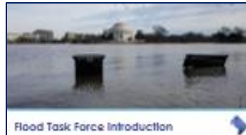
Slides 4 - 5

6:03 – 6:08 PM Flood Task Force Introduction (5 Mins) → 6:03 – 6:08 Monte Monash (2 mins)