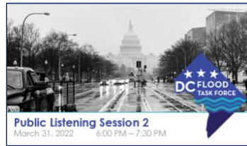
Slides 1 – 3

6:00 – 6:03 PM Welcome (3 Mins) → 6:00 – 6:03 Monte Monash (3 mins)