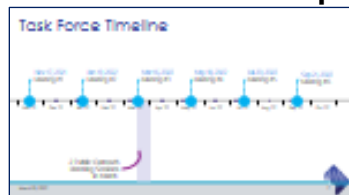
Slides 6 - 9

6:10 – 6:15 PM Greetings from CEO David Gadis (5 Mins) → 6:10 – 6:15 CEO David Gadis (5 mins)