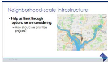
Slides 26 - 27

→ 7:10 – 7:20 Enora Moss & Meredith Upchurch (10 mins)